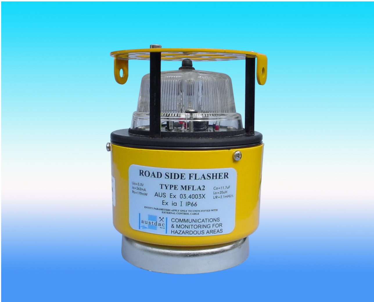
Photograph 1. The basic Roadside Flasher type MFLA2

The unit may also be provided with an attached control lead, see photograph 2, to allow the Road Side Flasher to be controlled by a set of voltage free switching contacts such as those on a pressure or level switch. This control allows the MFLA2 to be used in 'non-powered' alarm and warning annunciation applications throughout an underground mine.