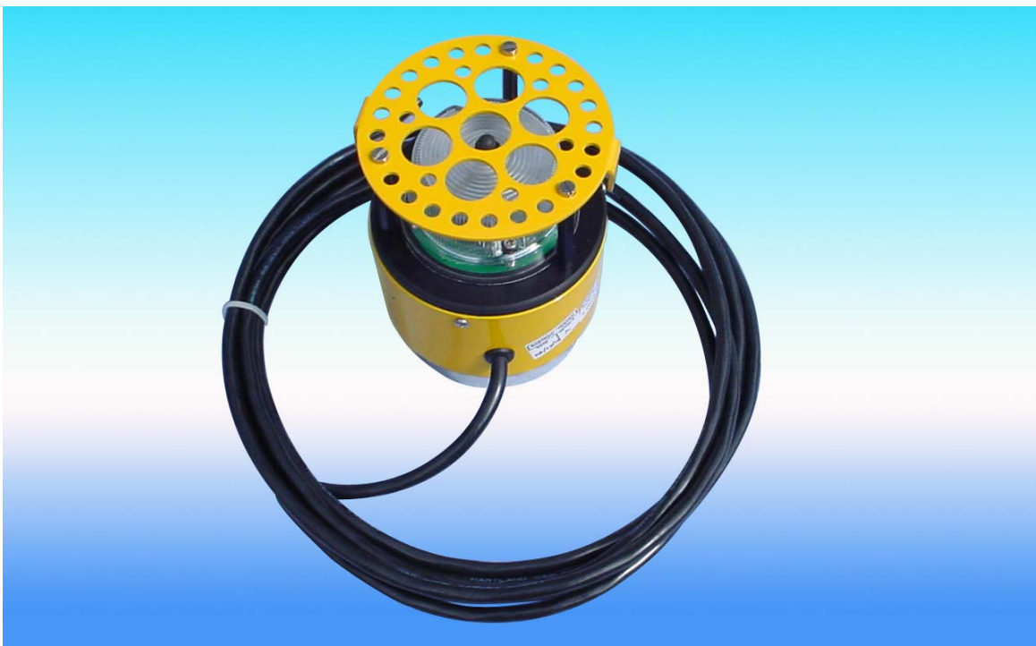
Photograph 2. MFLA2-EC-XX with attached 3m control lead.

The installation of the MFLA2-EC-XX is also straightforward, the Roadside Flasher is fixed in place and the external control lead routed to the control equipment and terminated. The external control lead should be routed and terminated in accordance with the AS2381.7 and AUS Ex 03.4003X. The installation should be tested for functionality to ensure that the lens mounted push-on / push-off switch is in the on position.