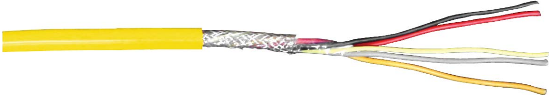
Part number CAC5C1BYU-yellow